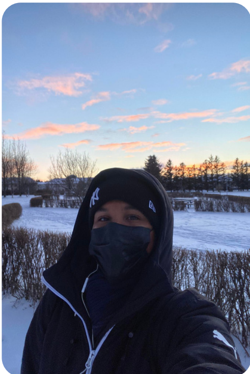
At Klambratún park

This experience has helped me to see the world and things in a different way, and I really recommend that anyone who can have the opportunity to do any cultural exchange, go for it, as this experience will change your perspective on life.