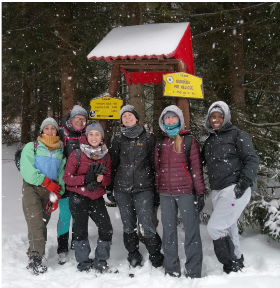
Doing activities together during wintertime, such as hiking in the snow and skiing, accompanied by our coordinator.

"What is great is that I have been able to make new friends, built my personal network, gained new experiences and learnt about cultural diversity."