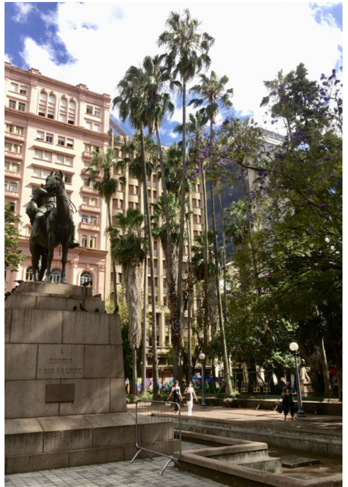
A park in the center of Porto Alegre

"I definitely see this as a positive and challenging experience during which I learned to become more independent and also got to know myself better - my likes and dislikes, strengths and weaknesses, what I have and miss when being far away from home."