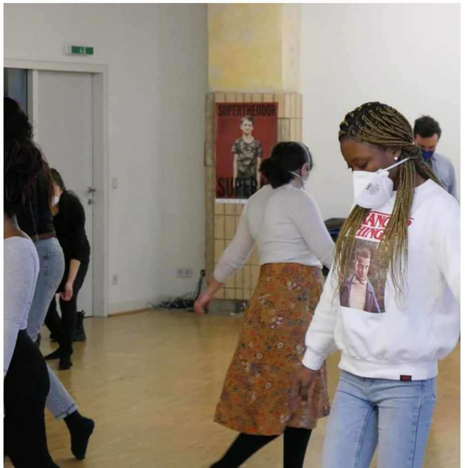
Participating in one of the antiracism workshops

“The world can be a better place if we accept people genuinely, love and show a little act of kindness regardless of their colour, race, religion, culture, language or identity.”