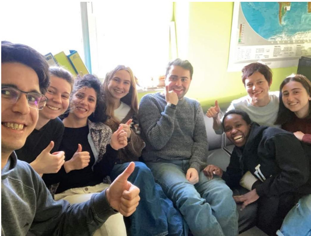
Me with other volunteers from Turkey, Georgia, Austria, Germany and Spain. We had team building activities together with the staff members of KERIC.

My main tasks include: cooperating with local schools, English conversation lessons for adults, teenagers and children, assisting in running the KERIC office, preparing workshops, summer camps, space for individual activities in KERIC, European culture awareness activities and other activities in local schools.