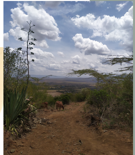
Descending from Mt. Margaret. You can see cattle almost everywhere: in the village, in the town, even in the city center. Literally anywhere!