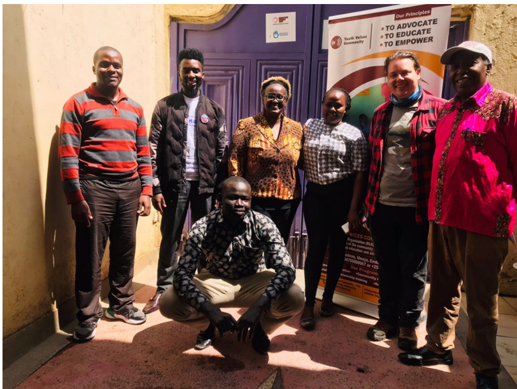
One of the work meetings with SlumTV helping us to develop a storytelling project. We cooperate with many other organisations to improve our services and the lives of refugees.

I must say, interviewing these refugees is a big challenge, though I was still looking forward to getting started. Even though I have always been eager to listen to other people's stories, recording their experiences and making these accessible for others is something completely different for me. Also being in Kenya has not always been easy. Despite the very nice people around me and the amazing experiences I have gained so far, sometimes it can be exhausting when there is no water or when the infrastructure is collapsing. On the other hand, that is the reason why I came here. I wanted to reach another level of storytelling, and live the daily life here with the locals. As I mentioned, a new experience it's sometimes very challenging. Sometimes, when facing an obstacle I'm asking myself: „what the heck did I decide to come here for?“, but then again I'm so happy when I see the progress I'm achieving. You know, it was never supposed to be easy. If it would be easy, it wouldn't be worth it! I believe that facing these challenges now, will help me to become a professional storyteller one day. To achieve this, stepping out of my comfort zone is totally worth it!