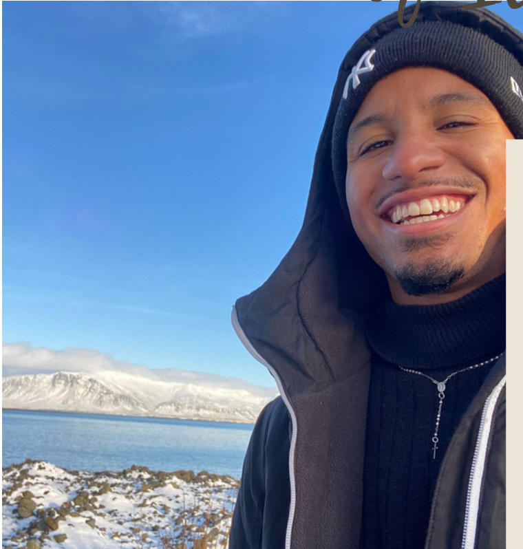
A day at the harbor in Reykjavik with beautiful mountains in the scenery