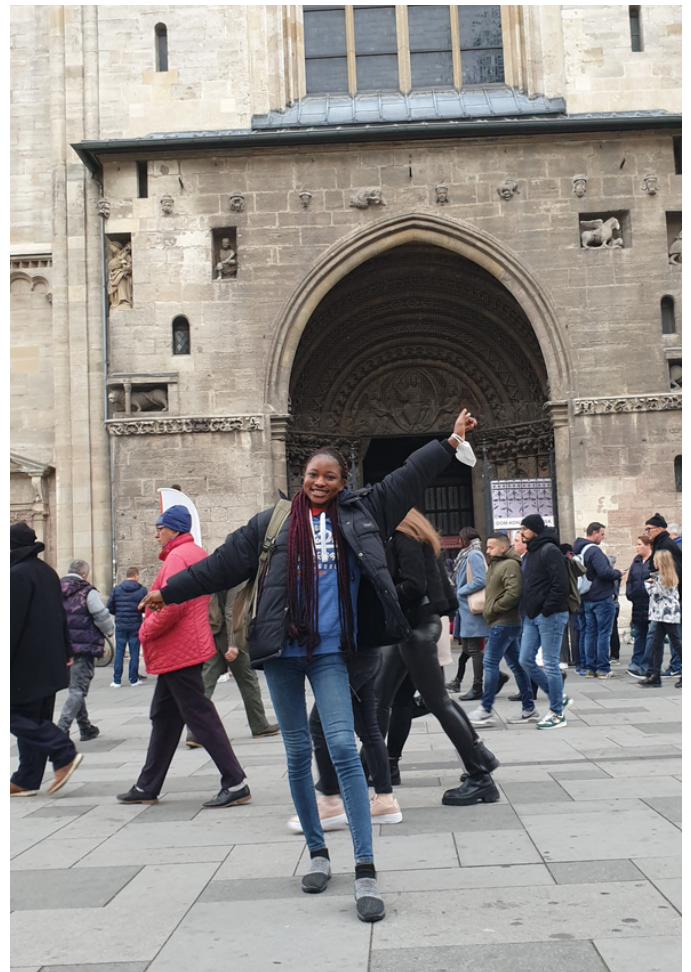
A visit to Stephansplatz, one of the biggest city centers in Vienna

However, I do feel like there is a high percentage of discrimination in this countries even though it varies from person to person. Sometimes, someone may feel they are not discriminating but the person involved actually feels discriminated by their behaviour. There are some who don't even want to sit next to me on the bus, train or tram because I am black, and would rather prefer to stand. In the beginning, I felt really bad, but the ability to accept and reciprocate their act with love and kindness made me feel better.