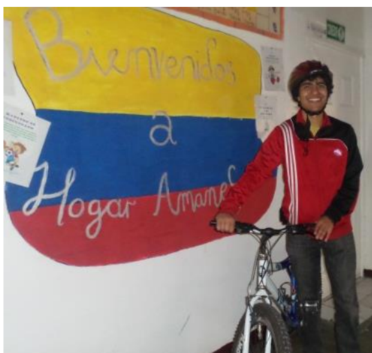
Me at my project by bike

Although I was relatively flexible with my expectations for this year, it was really important for me to do classes with children for my project. That's my type of activism. I'm not going to protest on the street for a better education system, and one year would also be too short an amount of time for this. Instead, I'm taking on the role of a teacher and I get involved in that sense. In my opinion, volunteering is closely connected to activism because the volunteer shapes the project as an active part. A German ex-volunteer recently told me about his football project in Germany, which after six chaotic years became a successful and sustainable project. Maybe – or for sure, it's not always that easy but these are valuable experiences from which we learn and eventually continue working on.