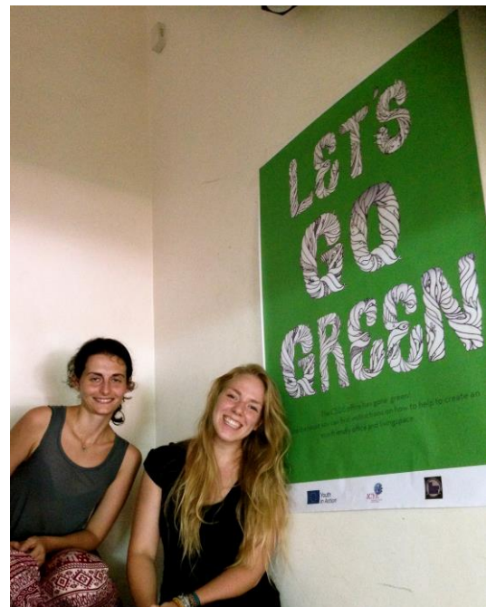
As an art student, I have often been entrusted with the designing of posters and such for the promotion of our various causes.

I then joined a week long project known as the Global Green Camp, a project organised by my host organization Volunteers for Peace Viet Nam (VPV). This project focused mainly on promoting environmental sustainability in the An Lac region, a rural district in the north of Hanoi. Together with volunteers from around the globe I travelled to An Lac, where we lived and worked with the villagers, dug holes for compost in their back yards, swam with water buffaloes in the stream and put up signs in the beautiful forest, instructing tourists on how to dispose their trash.