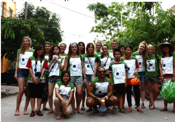
An army of environmentalists heading off on a foot-rally for the plastic bag campaign

A couple of weeks in, I started working for an NGO called The Centre for Sustainable Development Studies (CSDS). CSDS organises a range of projects, which promote education for sustainable development in Vietnam. They help poor communities build better schools and education systems; they help empower women and youth and raise awareness on environmental problems. Since my arrival I have worked on a variety of projects, the first one being a campaign where we encouraged people to reduce their use of plastic bags, focusing on a local market in a busy area of Hanoi city. This is a much needed campaign seeing as Hanoi alone produces around 70 tons of waste from plastic bags each day. Together with a team of experienced international volunteers, we organised many events to advertise our campaign for environmental protection. Though our message has been carried far and wide, it begs a significant question: Has it been heard, and, more importantly, will it be heeded?