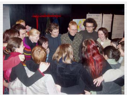
Training Course in Vukovar, Croatia, December 2004

At the end of the training, participants felt that they had acquired useful practical skills to foster the development of quality exchange projects between EU and SEE countries, which resulted also in a number of collaborative agreements between participating organisations. The follow-up included activities to develop the existing online documentation of volunteers' experience, and examples of good practice (see: <a href="https://www.seeyouth.info">www.seeyouth.info</a>).