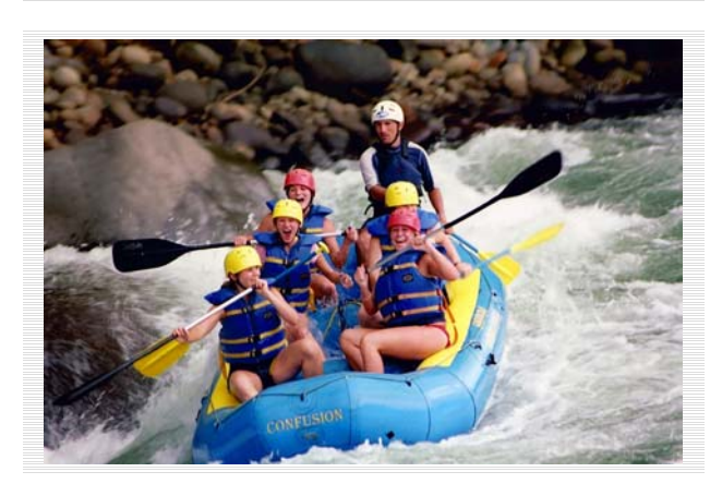
Volunteers in Costa Rica having fun in a raft boat called "Confusion"