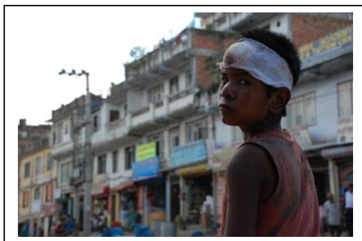
Kid in the streets of Kathmandu

deep connection in a totally different culture and country and that, I think, has given me lots of tools to understand other cultures as I understand my own culture better too. Sometimes we need to go far to see more clear the things that are close. Nepal is a lot poorer than Finland and I have seen and heard so many sad stories. People working like slaves, child trafficking, street kids, orphans, corruption, poverty and what else. And being a woman, and really seeing what kind of rights (or better to say, not having so many rights) many women suffer. I realise better how much I have and