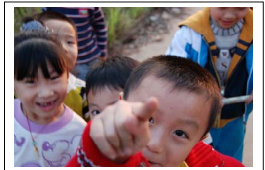
Kids at the nursery school

The noise and the rudeness of men are sometimes difficult to stand. People talk loudly at the same time: Men scolding wives, people pushing you in the overcrowded buses, no respect for the old ones from the well-off youngsters. People have been turning greedier since the Government opened to the market, and tourists are seen mainly as money providers more than resources for a future sustainable development. On the other hand, though, people who are very friendly, even though it is hard to make close friendships with them. Unless they were somehow exposed to foreigners before, whether for studying abroad or for attending foreign schools here, their mind is still trapped in the communist education system and it is difficult to let them go beyond certain barriers.