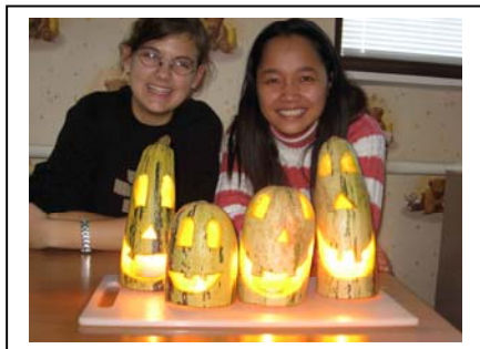
Ly with a friend

On the one hand, living among a lot of people from different cultures such as German, French, Spanish, Lithuanian, little by little I became more open-minded and it also gave me the chance to evaluate my own social and cultural value in comparison with Lithuania culture in particular and European in general. I also enhanced my language and communication skills for I nearly always used English as the main language to communicate with many German and French volunteers. I learnt to live alone and take care of myself when living in a new culture. On the other hand, I experienced moments when I felt lonely when I am so different from the others, no one can share the same value and belief. Scared somehow when guys annoyed me when I went outside.