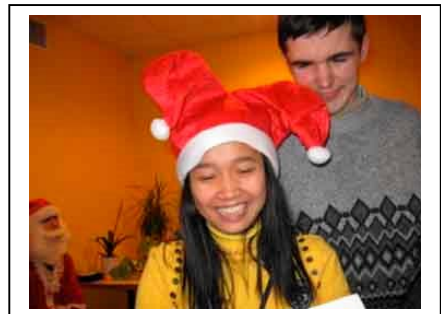
Ly celebrating christmas

I think I have integrated in the local life here. I feel more comfortable when going outside, talking with the local people. When summer came, they also became friendlier, open-minded. Colourful clothes, smiling face are seen everywhere in the streets instead of the colour of grey that cover all the ground, the sky and surface during winter. Little by little, I enjoy the nature in Lithuania which changes day by day; actually it cheers me up. I used to be afraid of seeing broken bottles of wine or beer in the streets. I am even obsessed deeply by this image. But now I am getting used with seeing them and I am not scared of them as before. I have nice Lithuanian friends, who share their feelings with me, help me to get to know more about their