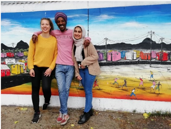
Table Mountain can be seen from the window of my workplace as I write this article. My journey in South Africa has already passed its half milestone, and I am interested to see where these last months will take me.

for example new social enterprises, by creating means for intercultural encounters that might not have happened otherwise. This journey has definitely made an impact on my life and I hope that my time here and our teamwork has made an impact on someone else's as well. From time to time, it has been difficult but has also opened my eyes to make sure that I will continue working towards equality in the future.