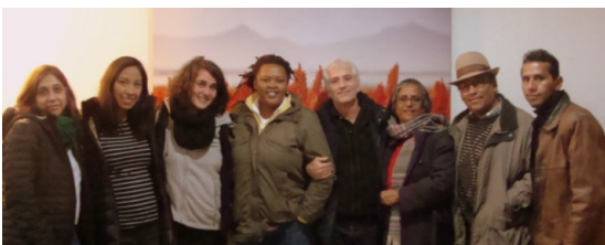
Authors of the handbook

Produced within the scope of the Erasmus+ project “Volunteers at the Interface between Formal and Information Education”, the Non-Formal Learning Handbook for Volunteers and Volunteering Organisations offers a wide selection of non-formal learning methods to enhance academic achievement, intercultural learning, physical and emotional development of children and young people. The handbook is targeted at staff, youth workers, trainers and facilitators of volunteering organisations, who prepare, train and support volunteers for their voluntary service in formal and non-formal educational host organisations, in order to transfer to volunteers the necessary non-formal learning tools and skills to be used in different kinds of educational institutions, contexts and settings. The handbook is meant also for volunteers, offering them 40 different non-formal methods that can be used in their educational host organisations. The handbook can be downloaded here or Learn more about the project here .