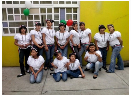
Awesome girls from the "La casa de la Esperanza"

However, this experience started to sink in and I felt them opening up and actually wanting to know and experience more about African culture from music to food and even language. I made friends who guided me, who coached me in Spanish language on a daily basis, who corrected my mistakes and who above all made it easier for me when I missed home too much.