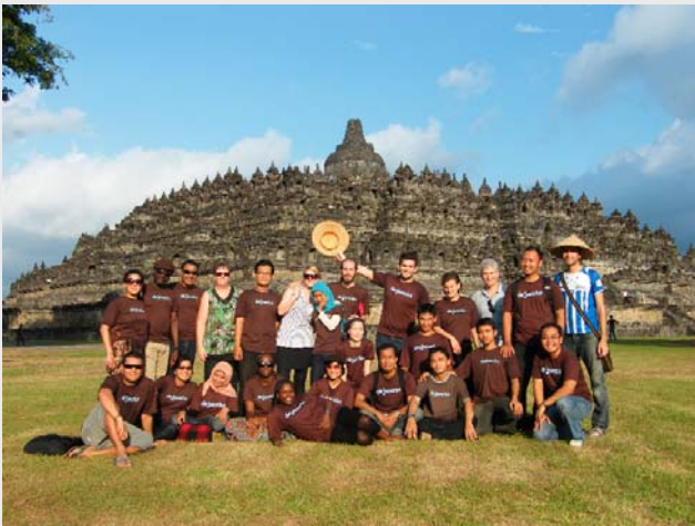
Participants of the WW Training Workshop in Indonesia

This process will culminate in a final General Conference, to be held in Berlin in March 2011, which will deliberate on and adopt programme development strategies stemming from the training workshops.